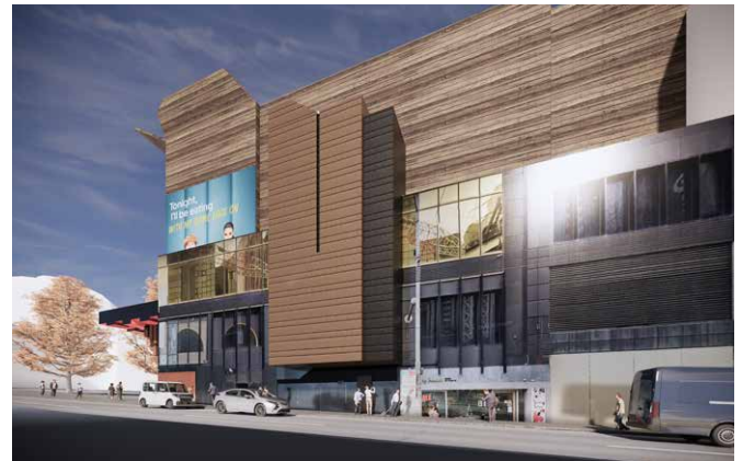
Upgraded vent at Melbourne Central east. Artist impression – subject to change.