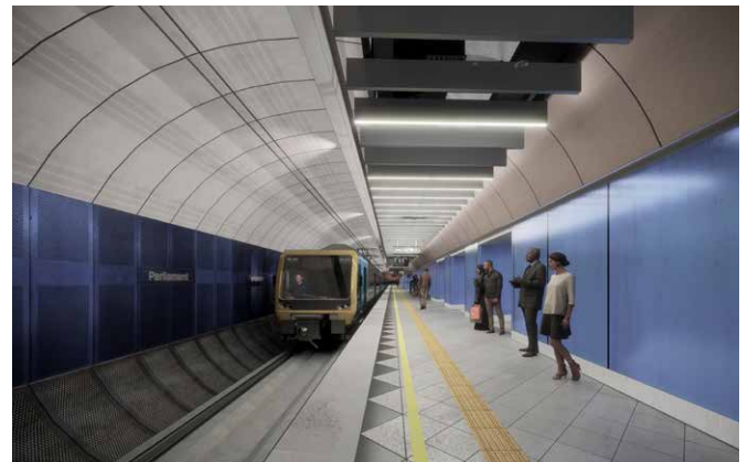
Upgraded ceiling battens at Parliament station platform. Artist impression – subject to change.

Plan ahead at ptv.vic.gov.au or call 1800 800 007.