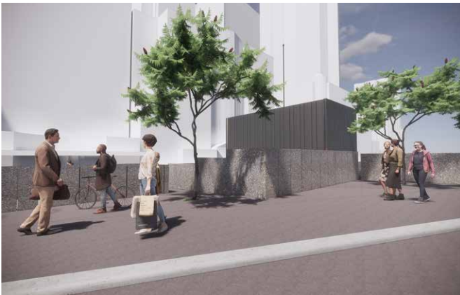
Upgraded vent at Parliament north. Artist impression – subject to change.